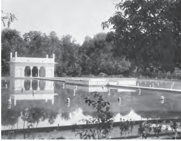
Shalimar Bagh, Lahore

The period of Shahajahan was the most glorious period of Mughal architecture. 'Diwan-i-Aam' and 'Diwan-i-Khaas' in Red fort, 'Jama masjid', 'Moti Masjid', were built during his period. The 'Taj Mahal' of Agra built by him is incomparable and immortal. Later, the Mughal architecture began to decline.