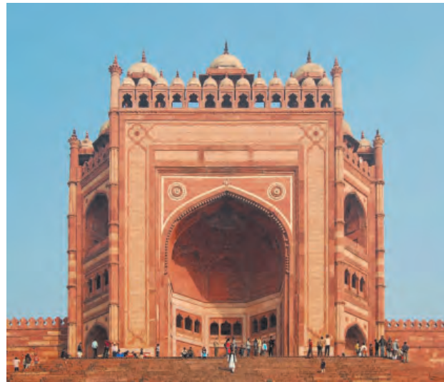
Buland Darwaza, Fatehpur Sikri

The reign of the three emperors, Akbar, Jahangir and Shahjahan was a period of peace, order and prosperity. A new era began in the field of art and architecture. The etched designs on the marble walls of Mosques, tombs and palaces are an evidence of the highly advanced styles of art and architecture. The carved designs on the tombs of Salim Chisti at Fatehpur Sikri and Taj Mahal are its paramount examples. During the period of Akbar and Jahangir the art of ivory carving received royal patronage. The Mughal paintings originated from the Persian styles of painting. There are miniature paintings of Persian style in the manuscript